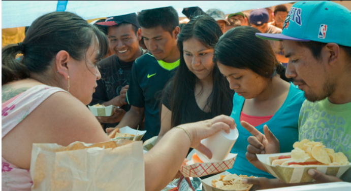
Female farmworkers are often left vulnerable to attacks by sexual predators.

75% of victims are assaulted by someone they know